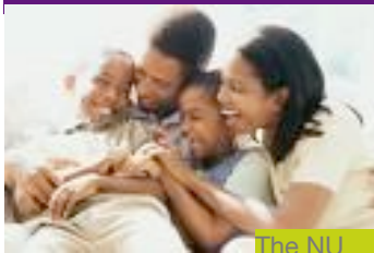
The NU Method is a registered Trademark of The NU Method Inc.